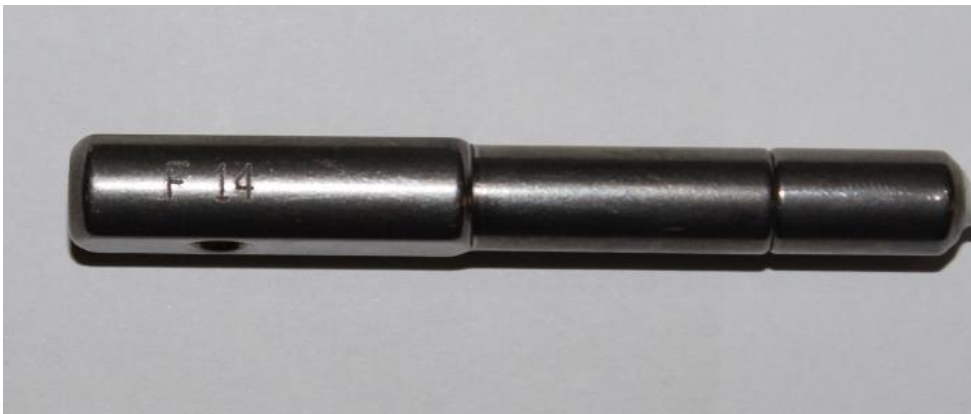
Fig. 4 Series F, year 2014 (marked on cutting unit cable)