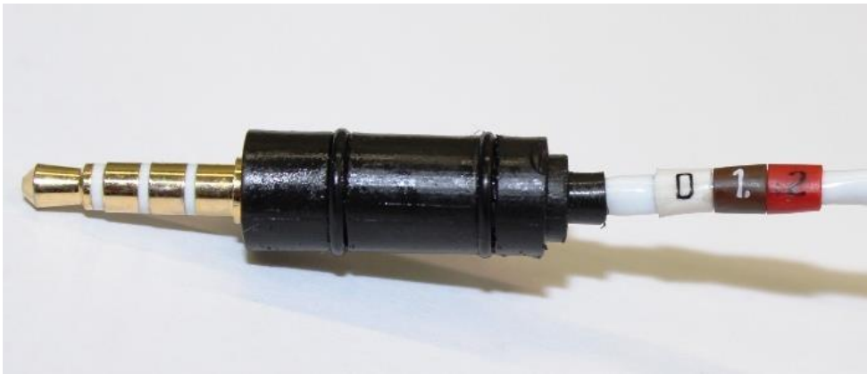
Fig. 3 Series D, year 2012 (marked on cutting unit cable)