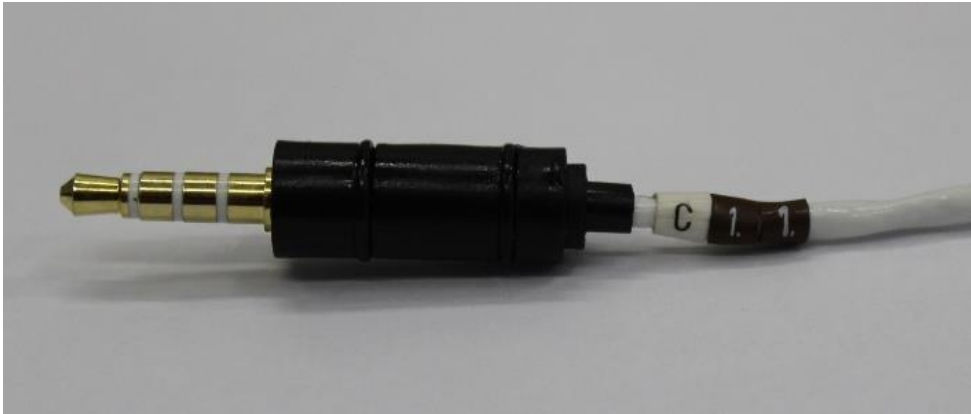
Fig. 2 Series C, year 2011 (marked on cutting unit cable)